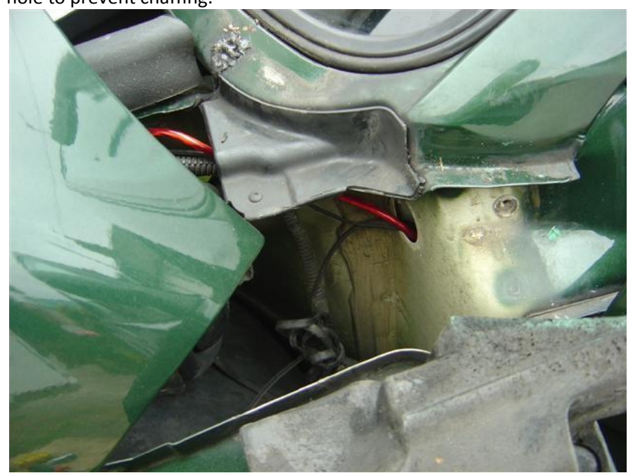
The wire exits in the passenger footwell by the door. Peel back the carpet a little to gain access.

Then you will need to unbolt the top three bolts in the wing under the sponge bit and carefully prise the wing away. You will see the wire which can then be passed into the Cabin through the hole shown. You should also ensure the wire is sheathed or a proper rubber grommet is fitted around this hole to prevent chaffing.