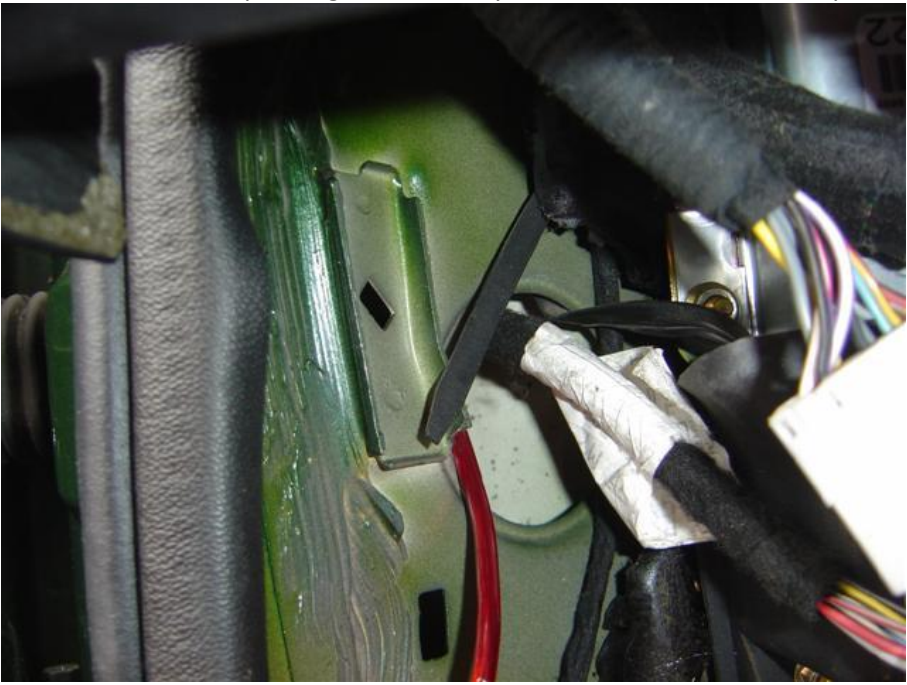
Then route it down the side of the car and under the rear seat to the boot. An easy job