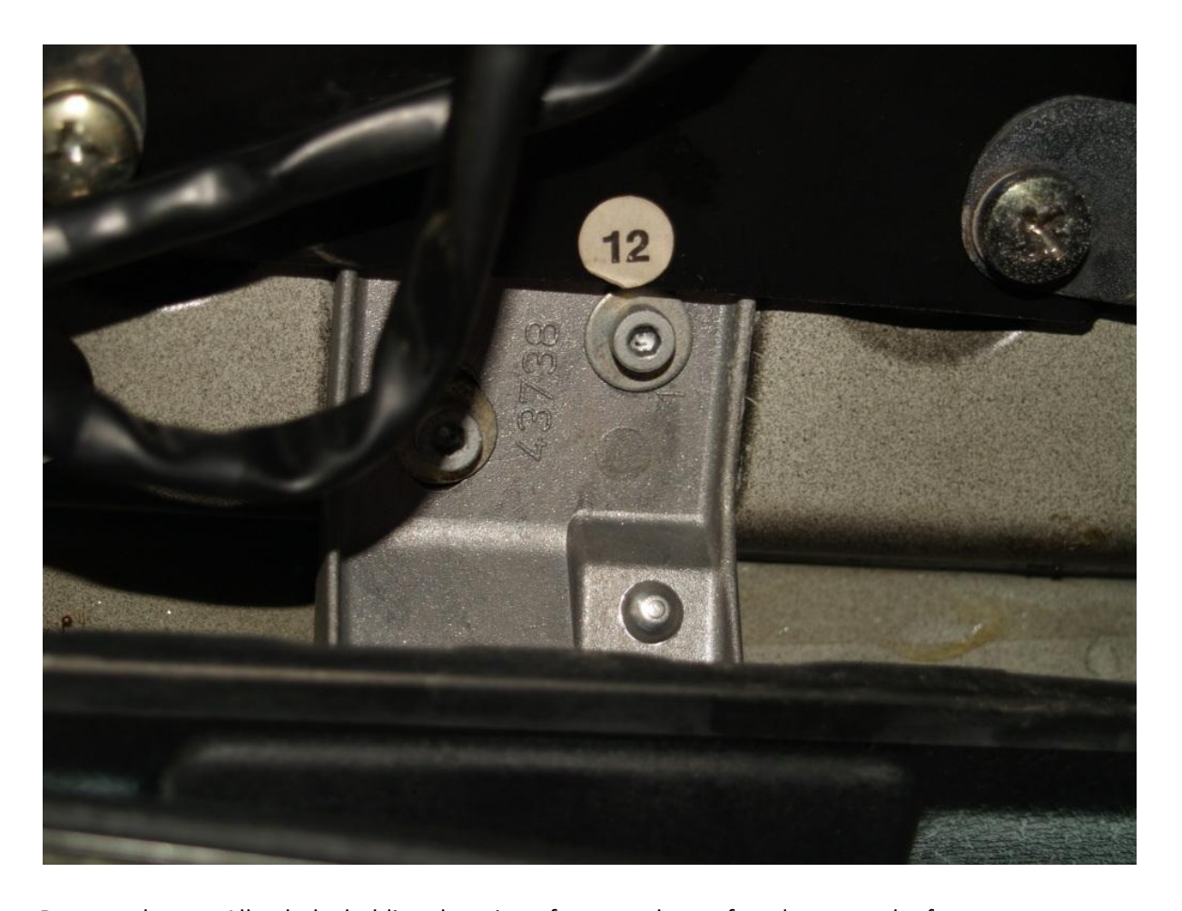
Remove the two Allen bolts holding the mirror frame to the roof, and remove the frame.