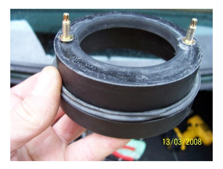
and screw back into place, <u>like this</u>