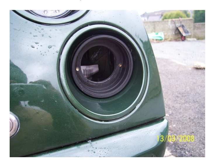
Then onto the centres the lights themselves: <a href="mailto:shown here">shown here</a>