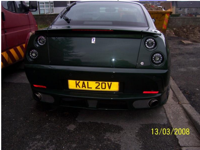
Whole job, start to finish, takes about 3hrs

Note that there is no colour showing through these lights as colourless bulbs were used so they all look the same when off in the daytime <u>like this</u>